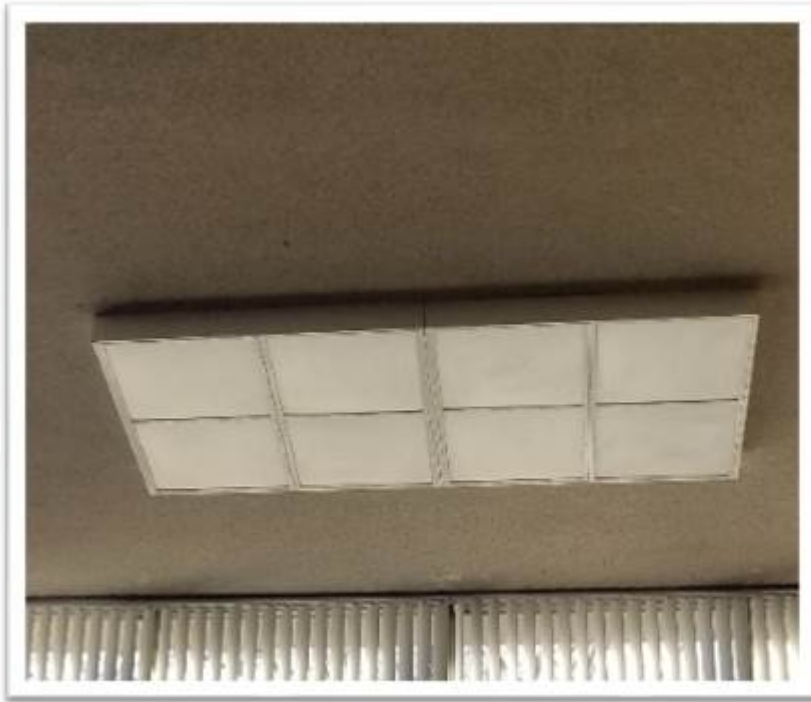
HIGH CEILING AREA